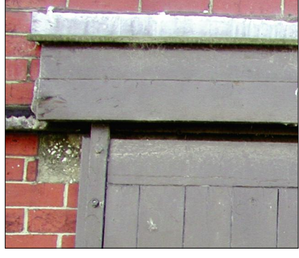
Built up bituminous roofing and bituminous asbestos fabric over a doorway