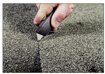
Cut and remove maneagable sections