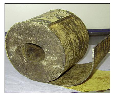
Floor tiles that contain asbestos can also have asbestos-paper backing, or be fixed with asbestos-containing mastic