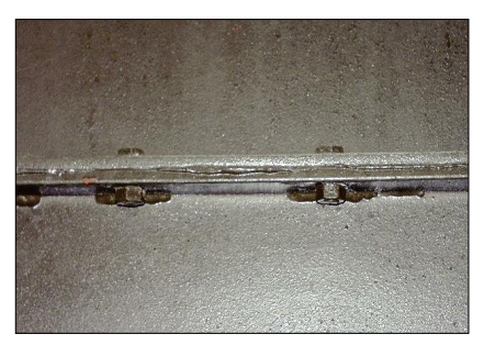
String gasket between metal sheets