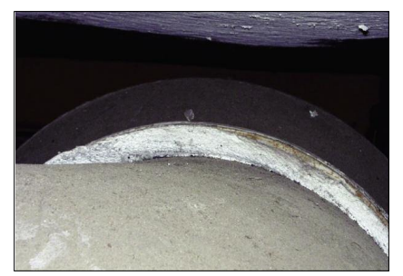
Joint packing on a flue