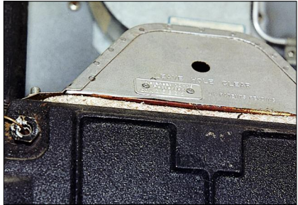
Some examples of rope seals found on boilers